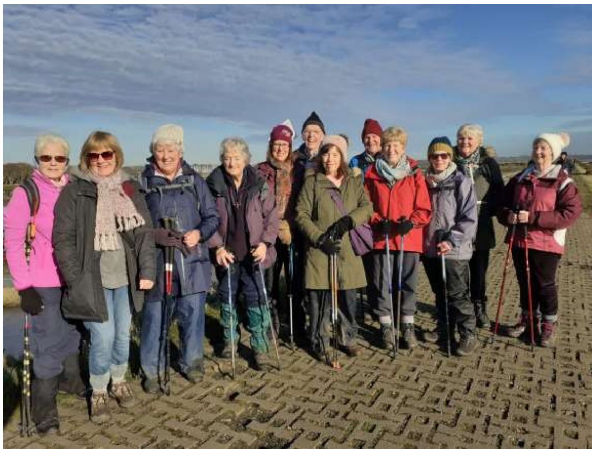
C party walk Lymington January holiday