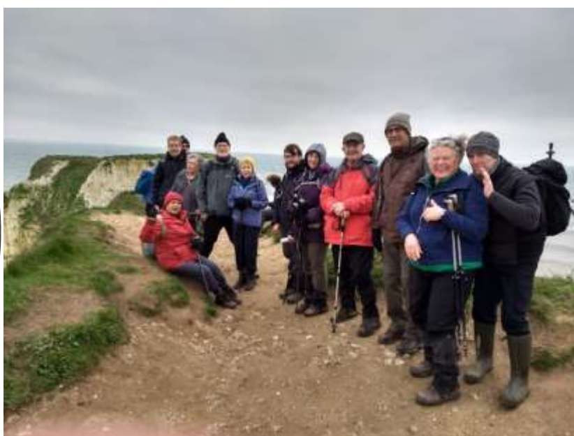
Old Harry Rocks, January Holiday